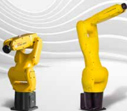
LR Mate 200iD